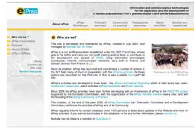
The www.ePrep.org home page