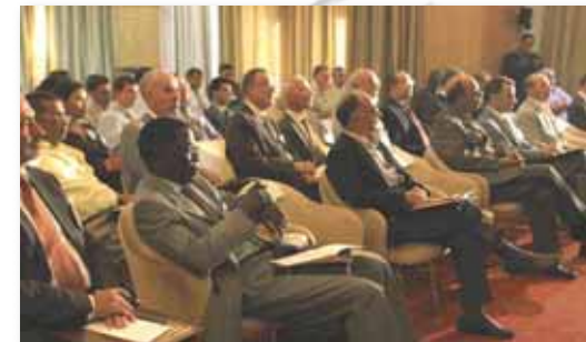
ePrep 2006 Thematic Seminar (Sousse, Tunisia) Birth of the ePrep CoP